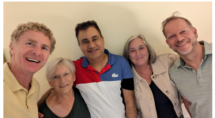
The 2025 Vineyard HOA board members, left to right...